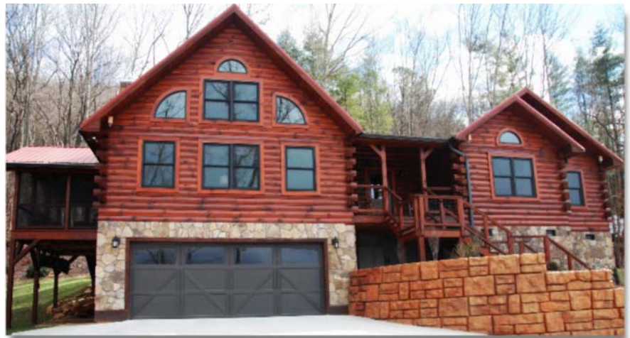
Clockwise from top: House Front, Screened-in Porch, Rear with Patio