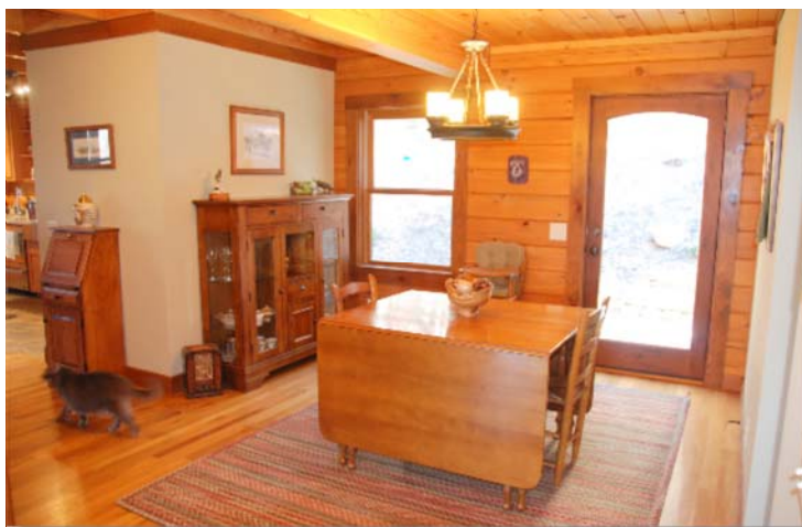
An heirloom dining table was accommodated in the floor plan design.

“We inherited a dining table that will seat 8 to 10, so we made sure that the dining room is big enough if we want to open the table fully,” Noreen said. “We also took into consideration that we might want a king-size bed for our bedroom. The only furniture we did not already own was our living room couch, though we had that picked out and had laid it out to make sure that the fireplace and electrical outlets would be placed advantageously.”