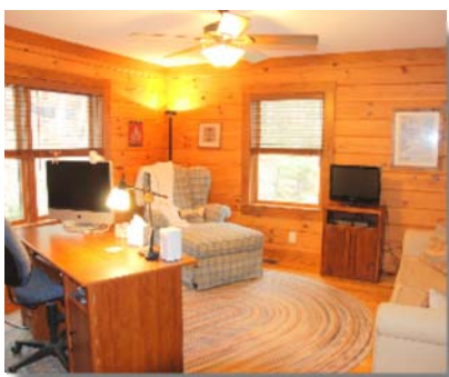
The home office takes advantage of the view.